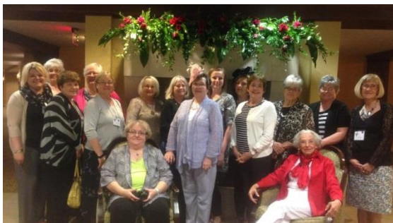
Green River Area Agents met for a painting party!

The Green River FCS agents enjoyed the opening banquet of the 2015 KEHA meeting with their Homemaker members.