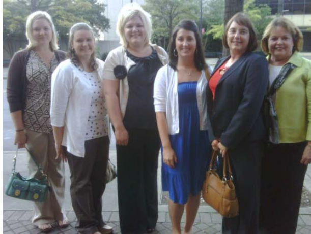
Green River at National Meeting